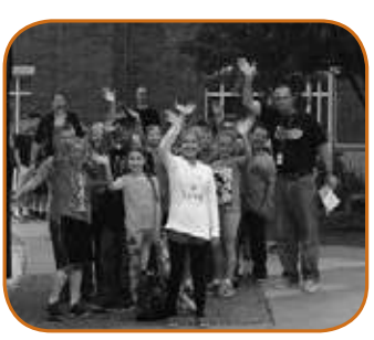
5th Grade MN Zoo Field Trip

WSU Science Trip - WMS Fort Snelling - 6th grade Art field trip - WALC Young Writers Conference English 9 field trip - WSHS Performance in the Park - WMS 7th & 8th grade choirs