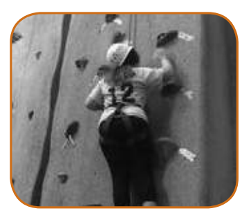
May 2015 Eagle Bluffs Field Trip