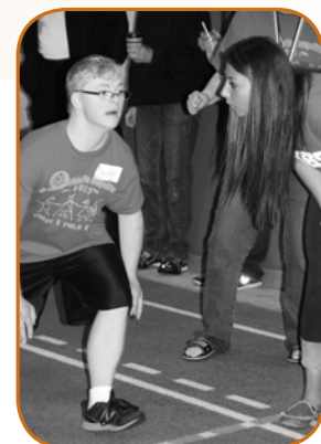
Special Athletic Competition

On behalf of the Board of Directors, I would like to extend our deepest gratitude for your generosity and kind support. Your help has made possible all of the special programs, projects, field trips and speakers listed in this newsletter- and much, much more. Gratitude goes out to each of you and I hope you will contact us with any questions or ideas for the Foundation and our schools.