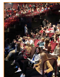
2019 Guthrie Grant