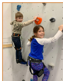
Climbing Walls & More Grant