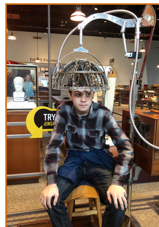
LEO Program ALC