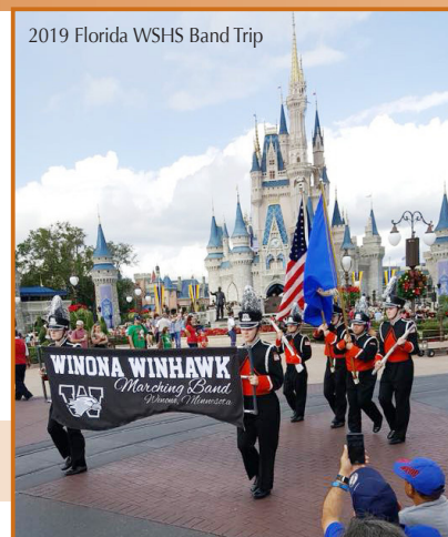
2019 Florida WSHS Band Trip

The Foundation for WAPS Board of Directors, and I, would like to extend our deepest gratitude for your generosity and kind support. The help has made all of the special programs, projects and field trips listed in this newsletter, and much, much more possible.